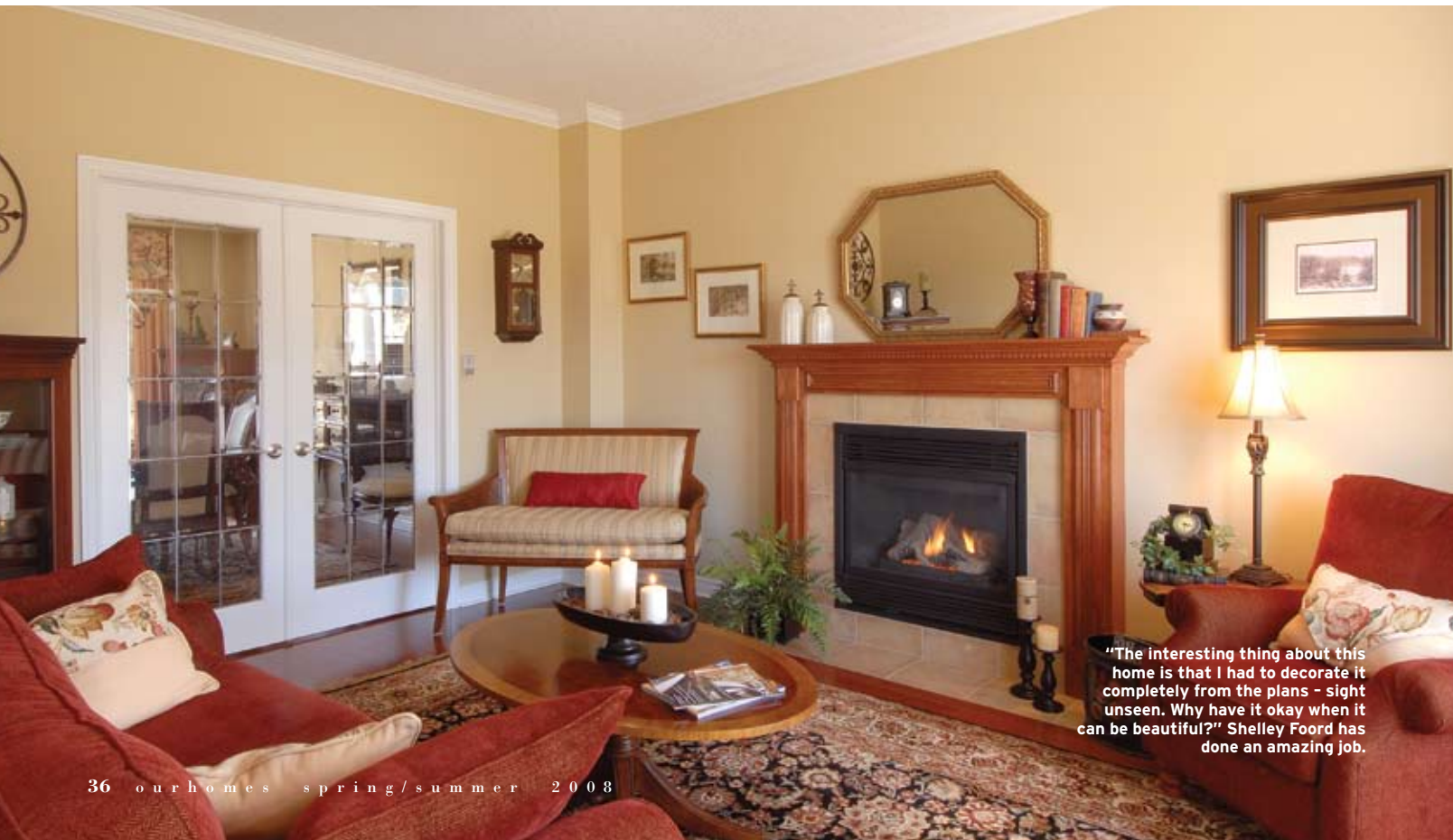
"The interesting thing about this home is that I had to decorate it completely from the plans - sight unseen. Why have it okay when it can be beautiful?" Shelley Foord has done an amazing job.