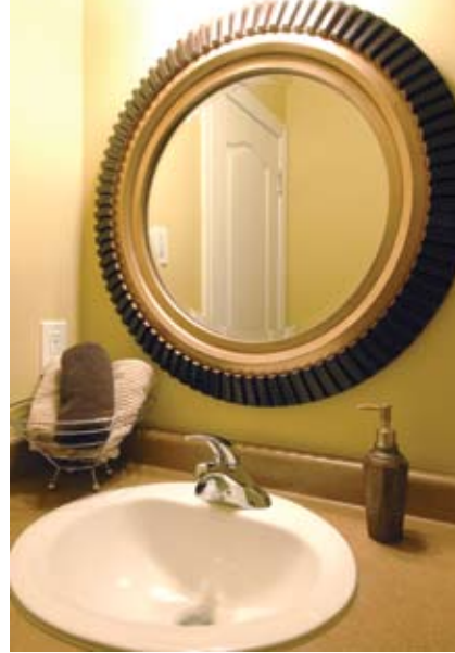
LEFT: Simplicity reigns in the powder room. The circular mirror edged in copper and walnut hues lend a sophisticated air.