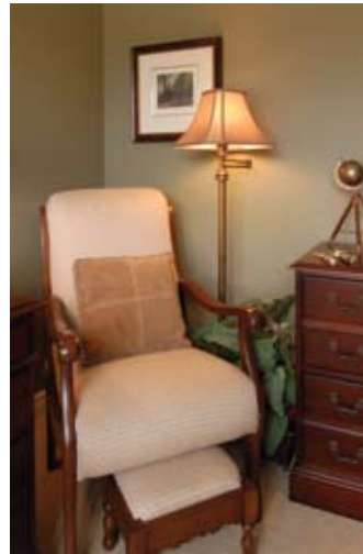
BOTTOM RIGHT: Another family heirloom is beautifully showcased here.